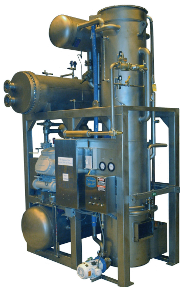
P34A All Stainless